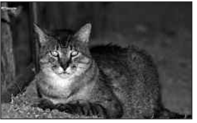
Feral cats make the perfect barn cat, needing only shelter, water and food.

Feral cats are outdoor cats and usually descen-