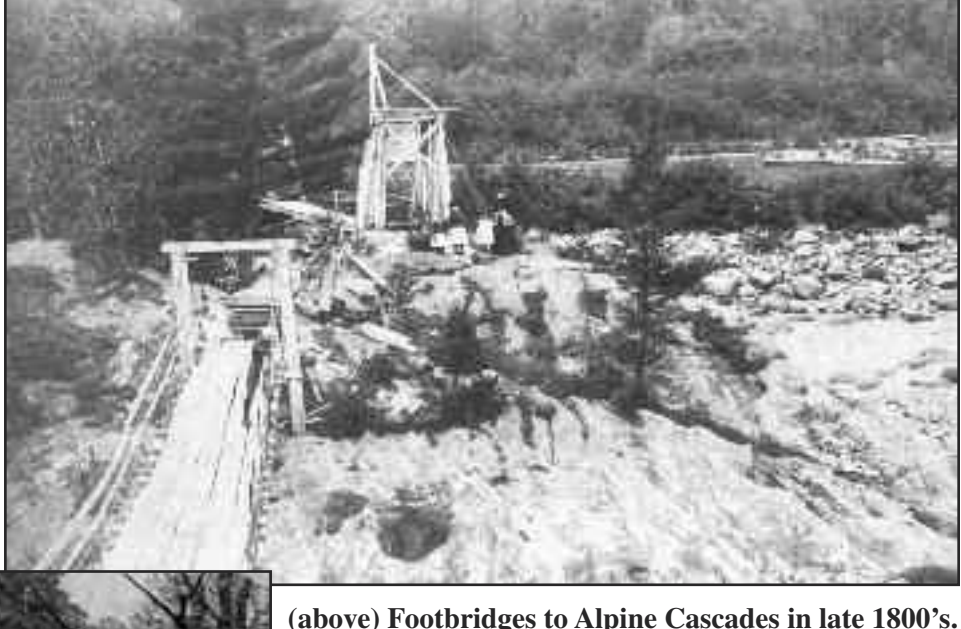
(above) Footbridges to Alpine Cascades in late 1800's.

The Alpine Cascades are 3 ½ M. from Gorham and 1 ½ M. from Berlin Falls, and